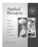
Volume 9 Number 1 2004 ➤