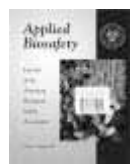
Volume 11 Number 3 2006 ➤