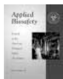
Volume 10 Number 1 2005 ➤