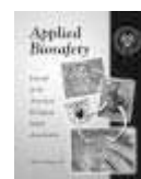
Volume 10 Number 4 2005 ➤