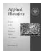
Volume 10 Number 2 2005 ➤