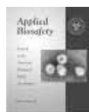
Volume 9 Number 3 2004 ➤