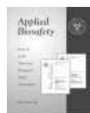
Volume 9 Number 2 2004 ➤