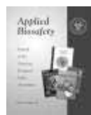
Volume 10 Number 3 2005 ➤