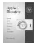
Volume 11 Number 2 2006 ➤