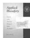
Volume 9 Number 4 2004 ➤